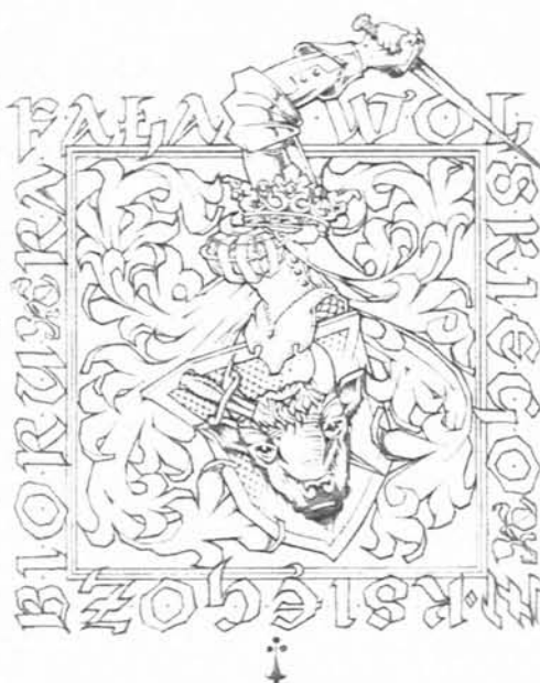
24. Pencil sketch of an ex libris for the Polish Consul in Germany, Rafał Wolski, featuring an old medieval coat of arms with the head of a European Buffalo

Despite the marginality of the armorial, both as heraldry and as ex-libris, there is nevertheless talk of a modestly growing interest. The danger remains that the increasing demand is chiefly met by the many so-called bucket shops which trade in fake arms, but fortunately